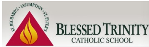
Blessed Trinity Catholic School ~ Richfield