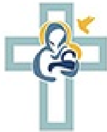
Mary Queen of Peace School ~ Rogers